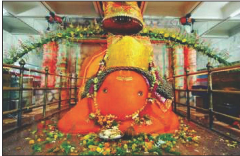
Ganesh Tekdi Mandir