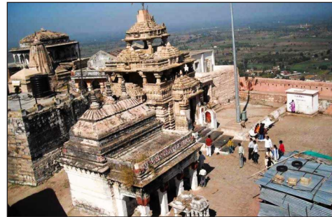
Ramtek Gad Mandir