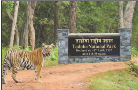
Tadoba National Park