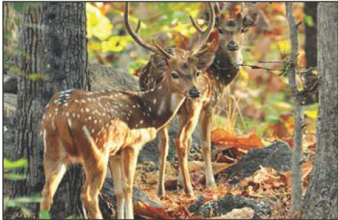
Pench National Park