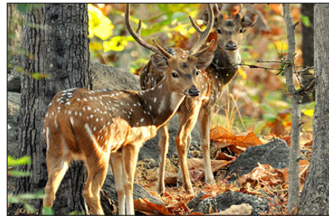
Pench National Park