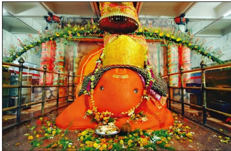
Ganesh Tekdi Mandir