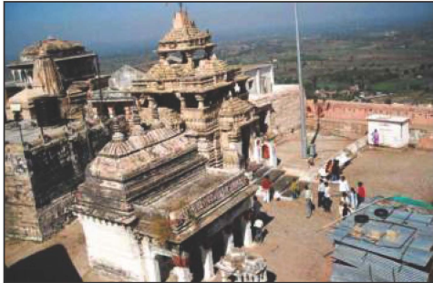
Ramtek Gad Mandir