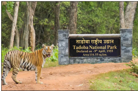
Tadoba National Park